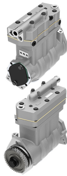
633.01.2000 (WITH GEAR)